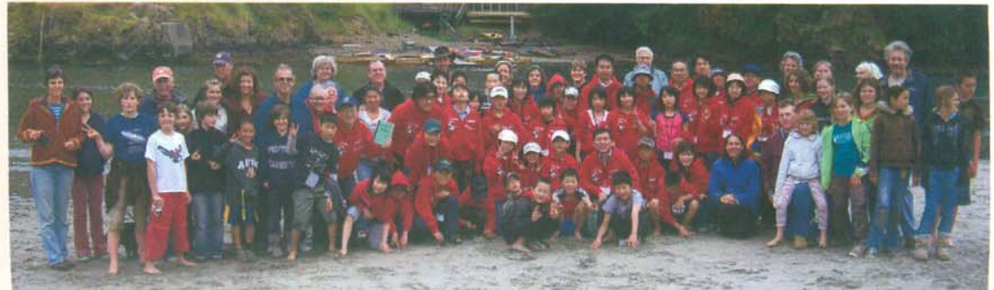
At the Beach with Homestay Families