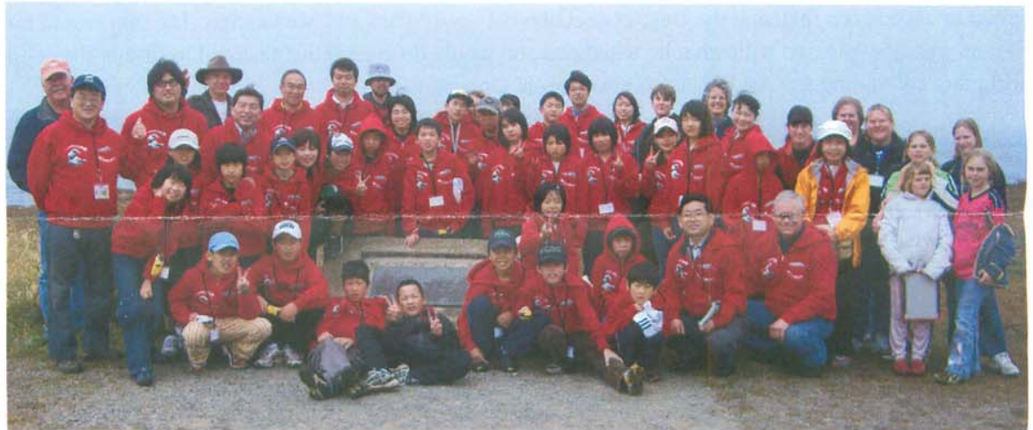
Group at Peace Plaque on Mendocino Headlands